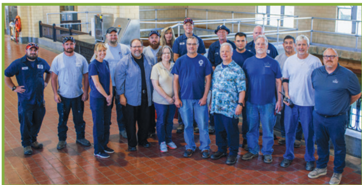
Three Rivers Water Filtration staff

Thank you for the notes and social media posts that many of you sent to our City Utilities' team. Your encouragement meant a great deal to our staff as we focused on our work while juggling the countless demands we all faced at home to keep our lives functioning and our own families safe.